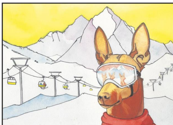
Pharaoh Hound Club of America • 2019 Western Specialty • Greeley, Colorado

Two Supported Entries, Plus Performance Events: AKC Agility, ASFA & AKC Lure Coursing, Rally and Obedience.