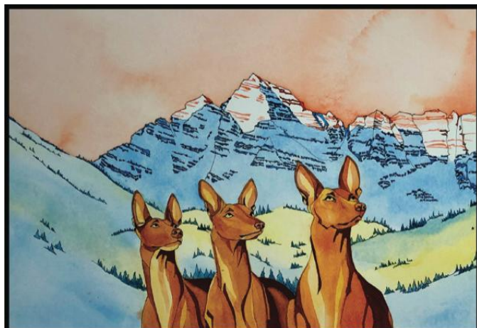
Pharaoh Hound Club of America • 2019 National Specialty • Greeley, Colorado